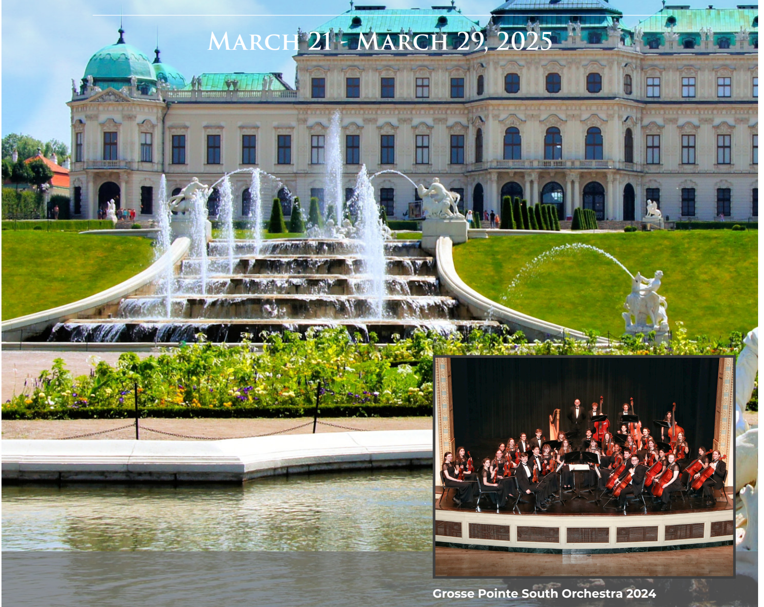
Grosse Pointe South Orchestra 2024